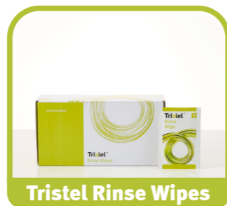
Tristel Rinse Wipes

Tristel Rinse Wipes are sterile wipes impregnated with deionized water, designed specifically to remove excess disinfectant from a medical device that has been high-level disinfected with Tristel Duo OPH.