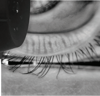
HIGH-RESOLUTION MEIBOMIAN GLAND IMAGING