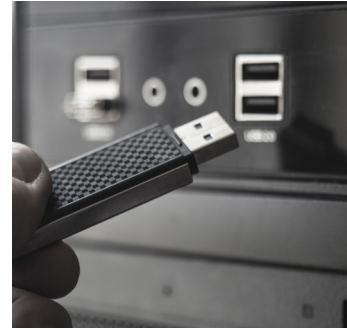
PLUGS DIRECTLY INTO YOUR PC USB PORT FOR SIMPLE EMR UPLOAD

Simply mount it on your slit lamp, align, click, and easily save to your EMR or imaging database.