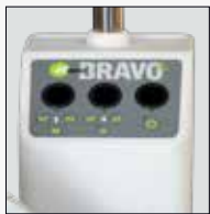
BRAVO 2 MEMBRANE CONSOLE PANEL

The Bravo 2 Instrument Stand from Marco combines a fresh, new updated design with our high standards of performance, function, and durability. With a strong emphasis on simplicity and economy, the Bravo 2 stand provides the perfect blend of everyday efficiency and value.