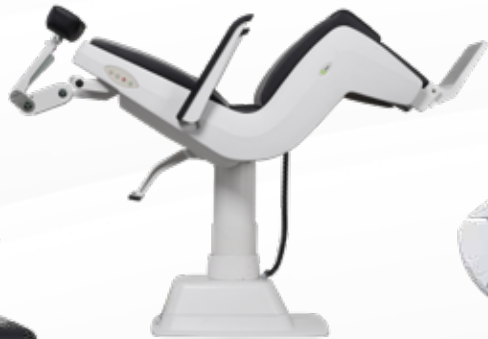
EXCLUSIVE TELESCOPING HYDRAULIC CYLINDER SYSTEM