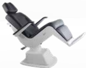
BRAVO 2, EFFORTLESS TILT

The Marco Bravo 2 Exam Chair offers the same great value of the original plus enhanced functionality and features. In addition to a smooth, quiet hydraulic lift, an effortless tilting recline mechanism is easy to access and keeps the patient in a comfortable position. With its modern, ergonomic design, and robust engineering, the Bravo 2 chair is made to look good and last.