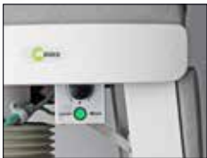
EASY, "DIAL-IN" PROGRAMMING CONTROL WITH SAFETY SWITCH TO DISABLE CHAIR OPERATION

The Marco Encore Automatic Chair features an exclusive hydraulic system that controls both the elevation and recline motion. Easy-to-use backlit fingertip switches control all functions of the chair, as well as programmable recline positions, auto-recline/return, and safety functions. A corded foot pedal and single-handed operation headrest are also standard. Optional surgical accessories are available for minor surgical procedures.