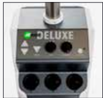
DELUXE MEMBRANE CONSOLE PANEL

A standard in the industry, the modern Marco Deluxe Instrument Stand meets the highest demands of function, durability, and cosmetic appeal. Innovative features include a re-designed lower slit lamp arm with multiple integrated adjustment functions, a modified refractor arm and instrument pole that provides convenient routing of cables, and a simplified membrane console panel.