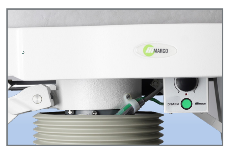
Easy, "dial-in" programming control