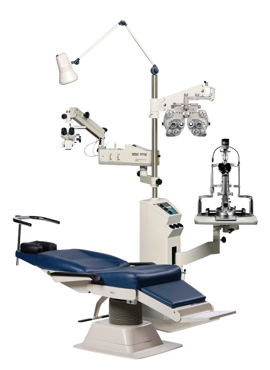
The Encore Automatic can be instantly transformed into a surgical/minor procedure chair.