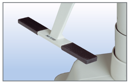
Foot-activated rotation lock can easily be activated from both sides of the chair