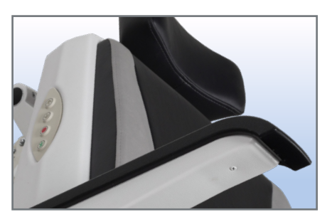
Ergonomically designed arms rotate up for patient flexibility.