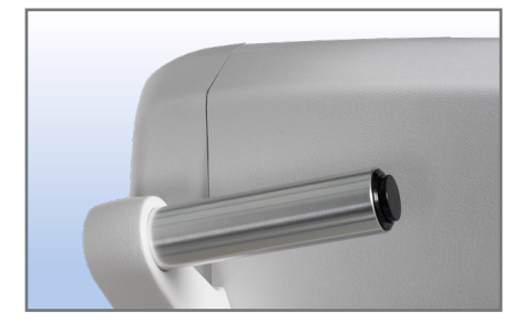
Angled push-button recline handles for easier reclining motion