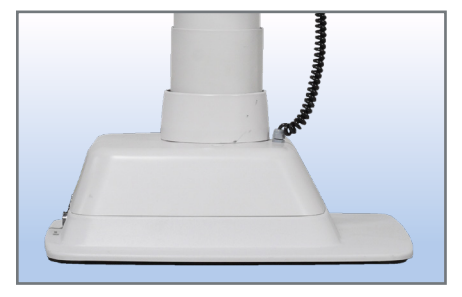
Exclusive telescoping hydraulic cylinder system