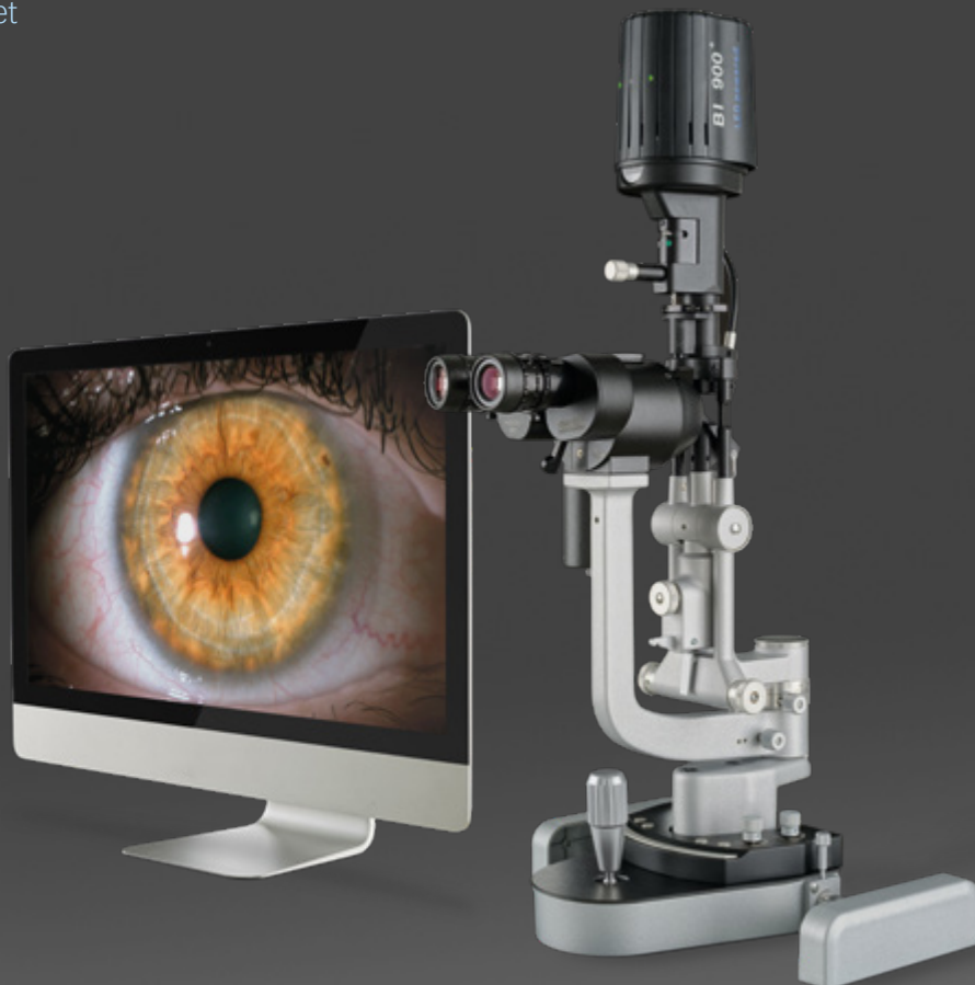
BI 900 with Imaging Set

Equipped with an improved version of the BM 900 microscope, an enhanced illumination system and the traditional high-precision mechanics, the BI 900 is the predestined successor to the legendary BM 900. With this new slit lamp, Haag-Streit combines simplicity and reliability in a modern system which offers integrated digital imaging as an option.